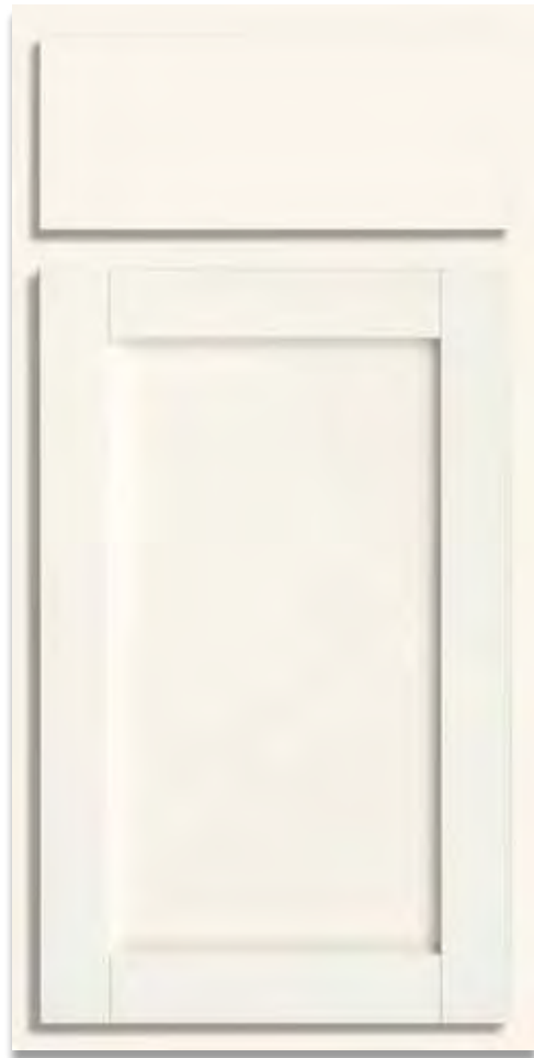
Door Style: McDurmon Wood Type: Laminate Finish: White