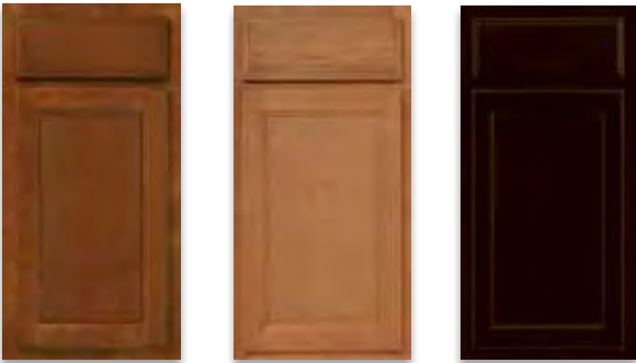
Clove Mirage Twilight