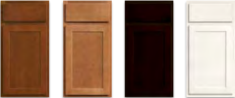
Clove Mirage Twilight Cotton Paint