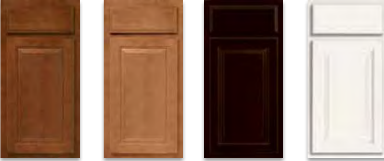
Clove Mirage Twilight Cotton Paint